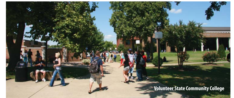
Volunteer State Community College